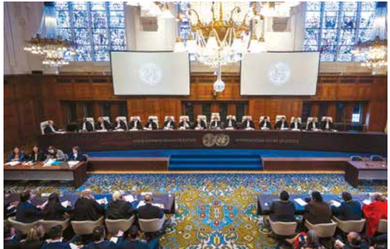
International Court of Justice

I think the most ominous and glaring example is the U.S. responding to these resolutions and decisions by the UN Security Council, with the argument that they regard them as "non-binding." That worries me the most, because if the United States sticks with that—I