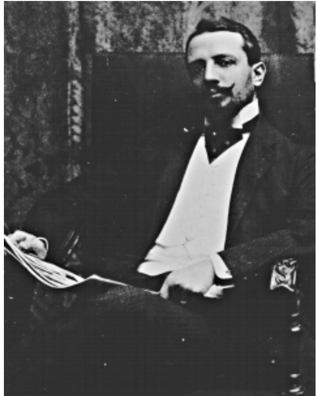
Count Giuseppe Volpi di Misurata, head of the “Venetian group” in Italian politics and industry, was Mussolini’s Finance Minister. He emphasized that corporatist economic organization was “the most characteristic achievement of the Fascist regime.”