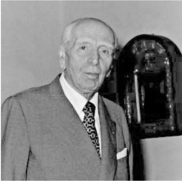
Count Vittorio Cini, a Venetian oligarch and former minister in Mussolini's Cabinet, opened the doors for Ledeen to the ultra-secret freemasonic archives in Rome and Venice.

contains both a well defined theory of human progress and a conception of the popular will that ties it to the extremist Rousseauvian themes of the Terror and the 'totalitarian democracy' that it spawned."