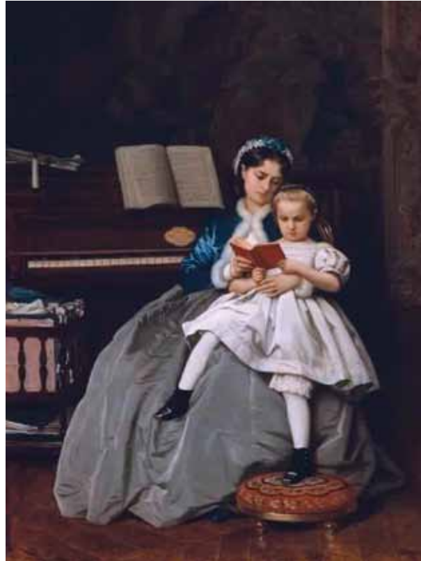
“Human life, is the characteristic manifestation of mankind’s specifically manifest-as-demonstrated, noëtic performances shown by the crucial evidence of the living human mind.” Here, “The Reading Lesson,” Auguste Toulmouche (1865).

Such, precisely, is the case in fact: it is located, precisely, in the actually noëtic powers specific to the human mind: in the higher source of the specifically