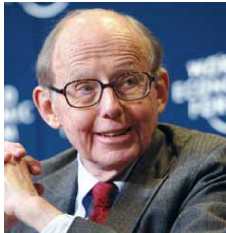
Samuel P. Huntington