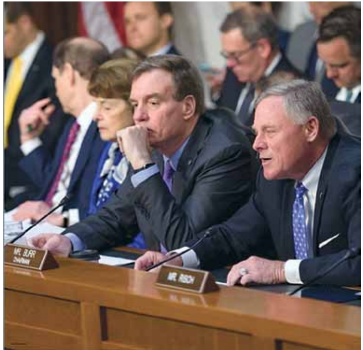
Sens. Mark Warner (left) and Richard Burr.

The Institute’s media campaign about the Skripal poisoning was designed to create “popular demand” for even harsher actions against Russia by the British government, while planting articles