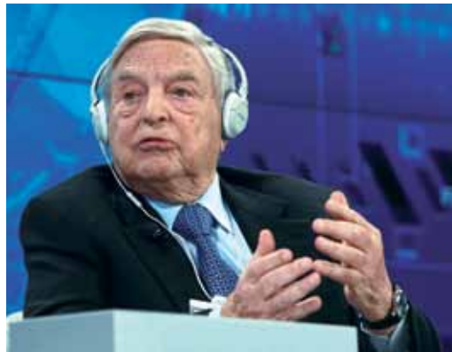
George Soros

also a large part of the function assigned to Special Counsel Robert Mueller.