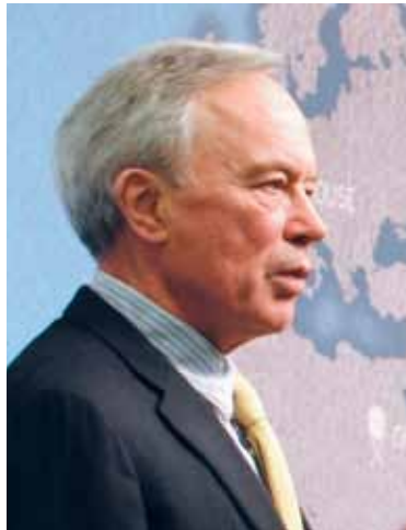
Sir Andrew Wood

groups of journalists, military and foreign office personnel, academics, and lobbyists, within almost every European country, the United States, and Canada, and is now looking to expand to the Middle East. These people get alerts, often through the medium of Initiative “contacts” in British embassies, to take action when the British Foreign Office perceives a need. The U.S. and British clusters are dominated by individuals from the Atlantic Council, the rabidly anti-Russian and anti-Chinese Jamestown Foundation, the Center for European Policy Analysis, and similar National Endowment for Democracy spinoffs.