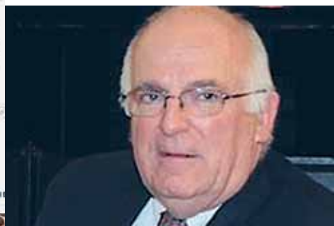
Sir Richard Dearlove