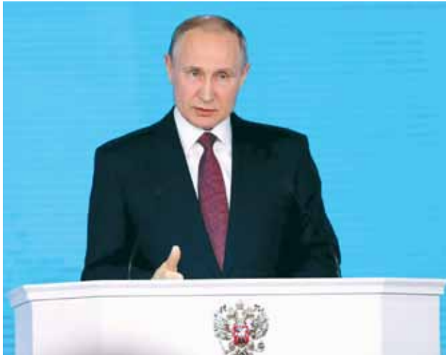
Vladimir Putin addressing the Federal Assembly on March 1, 2019 in Moscow.

national security situation, and create a serious threat to Russia, because some of these missiles can reach Moscow in just 10-12 minutes. This is a very serious threat to us. In this case, we will be forced, I would like to emphasize this; we will be forced to respond with mirror or asymmetric actions. What else does it mean?