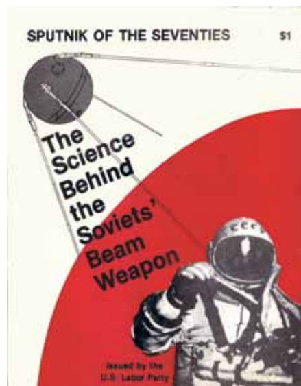
LaRouche authored this pamphlet in 1977.

... We seek neither military superiority nor political advantage. Our only purpose—one all people share—is to search for ways to reduce the danger of nuclear war.