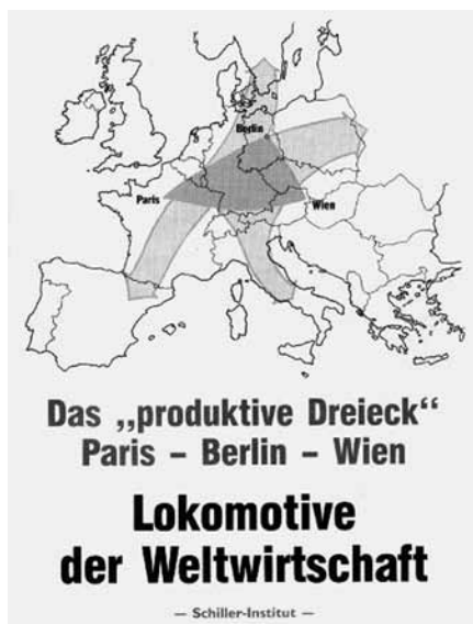
The Schiller Institute's 1990 pamphlet, The 'Productive Triangle' Paris-Berlin-Vienna: Locomotive of the Global Economy, published in Germany.

In the U.S., they (the British) have one immediate goal: Ending the disruption caused by Trump, by removing him one way or the other. They found that the “special relationship” was intact