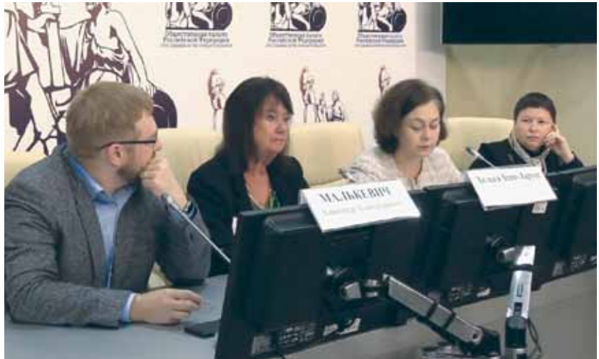
FAN-TV Federal News Agency