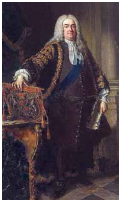
The famous South Sea Bubble (1720) of the whiggish (and some would say, “piggish”) Prime Minister Walpole, caricatured in this illustration, is a model for the wildly speculative financial-derivatives-like frauds of today.

We must emphasize that the rights of the living human individual, pertain to those aspects of his or her existence which are defined, in functional terms of benefits to society, in the continuing role of the existing individual personality, even when the person is deceased . This course of action must be executed to such effect, that the contributions of useful inventions and the shaping of advances in culture contributed as discoveries, or enhancements contributed by individual persons, live on, as a special class of ideas, in an efficient way, that within the accumulated foundations of society, even after the personality who made such a contribution, is deceased. This is to emphasize those rights and powers of the human personality, which are absent in the beasts, are human rights, which inhere, as in the sometimes theological concept of a simultaneity of eternity , as the essential immortality of the human individual member of the Noösphere, as a quality of existence functionally distinct from merely that which the once living mortal body of that now deceased person had inhabited while alive. 2