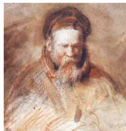
"Man's truly principled actions on behalf of mankind, must necessarily reach far beyond the span of mortality of the individual person." This is the vision of mankind shared by truly creative minds, such as the Apostle Paul (left, painting by Rembrandt, 1629-30), or Philo of Alexandria (right).

be the source of our joy in the labor thus presented to the future generations of this century.