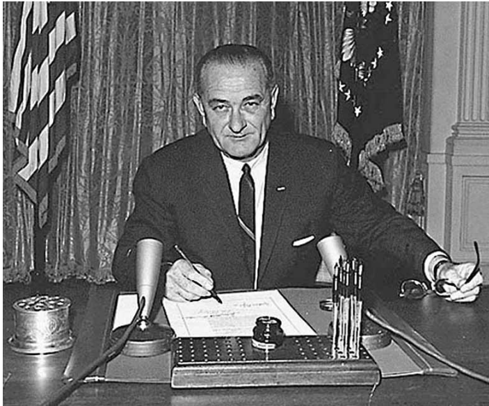
Lyndon B. Johnson Library