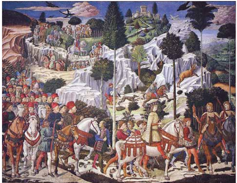
"It was the moral advantage of the commitment to scientific and related progress of the great ecumenical Council of Florence [1438-39], which sustained the innovative struggle for human freedom from the side of the republican forces." This painting, by Benozzo Gozzoli, of the "Journey of the Magi" (1459) celebrates the multinational character of the participants, many of whom came from great distances to attend the Council.

So, the great religious warfare of 1492-1648, had proceeded, since the time of Christopher Columbus's first trans-Atlantic voyage, from a conflict between the legacies of two great cultures, the republican Platonic and the monetarist-oligarchical Aristotelean. The insurgent, Platonic faction, had the essentially innate strategic advantage of its Classical cultural tradition of artistic and scientific creative genius, a factor of the modern tradition of that time which tended to give a durable