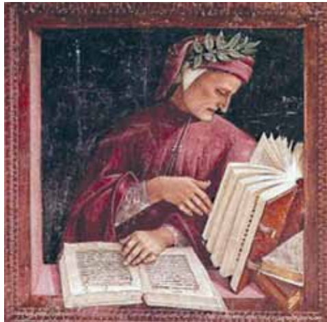
The discovery of valid scientific principles is made possible by a continuing process of development of human culture, exemplified by Dante's legacy in the Fifteenth-Century Golden Renaissance.

The deeper quality of such essential implications is assigned as the subject of the opening chapter of the main body of this present report.