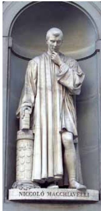
The wildly libelled Niccolò Machiavelli (left), defended the republican cause in Renaissance Florence, following in the footsteps of Leonardo da Vinci and Cardinal Nicholas of Cusa, against the evil Venetian predations of those such as Paolo Sarpi (right).

The coming-into-being of the British-led monetarist world system plunging into a global new dark age now, was a product of the conflict between the legacy of the great ecumenical Council of Florence and the associated roles of Filippo Brunelleschi and Cardinal Nicho-