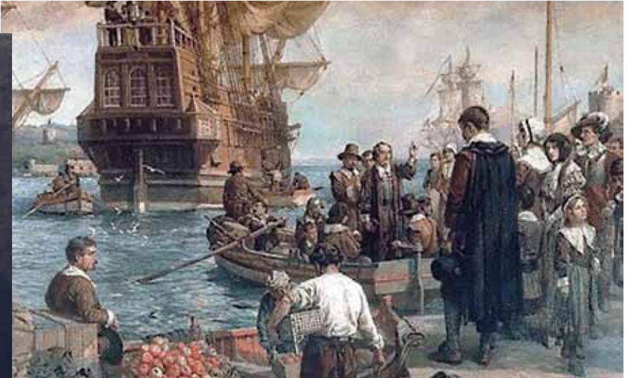
The combined efforts of the Mayflower compact and the founding of the Massachusetts Bay Colony, led by the Winthrops and Mathers, established a settlement containing the explicitly definable seeds of the later U.S. Declaration of Independence. Shown: John Winthrop (1588-1649); the arrival of the Mayflower at Massachusetts (1629).

That mission to Mars, is more important for what it requires of us, than its immediate gains. This is because, as some leading pioneers of the space program emphasized, whatever benefits such a success portends in the immediate future of those pioneers themselves, its greatest achievement for mankind will be that this consideration compels us to develop ourselves as we would never attempt such an achievement without devotion to the challenge of such a mission.