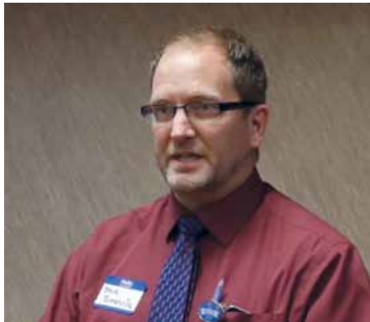
Pueblo, Colorado Physicians Code Red

I have seen many other reports on marijuana's effect on pregnancy. This is a crisis calling out to heaven. Women who suffer from morning sickness are told by pot dispensing personnel that marijuana will ease their symptoms. What many women don't realize is the impact this drug has on the fetus, because THC crosses the pla-