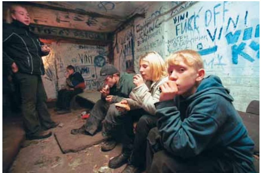
Teenage drug addicts hanging out in a cellar of a building in Saint Petersburg, Russia.

For many of our children, the escape from such terrors is drinking alcohol or smoking cannabis. The real crime is that the media—and many elected officials—are openly pushing for marijuana legalization. One of the key turning points in this effort was the almost universally successful campaign for the acceptance of “Medical Marijuana,” a fraud based entirely on lies. The crucial importance of this effort was that it redefined marijuana, a Schedule I Controlled Substance, as