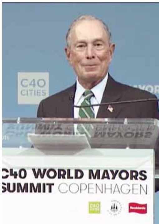
Billionaire Michael Bloomberg talks trash at the C40 World Mayors Summit.

C40 was founded in 2005 by Ken Livingstone, then the Mayor of London. Its current President is billionaire