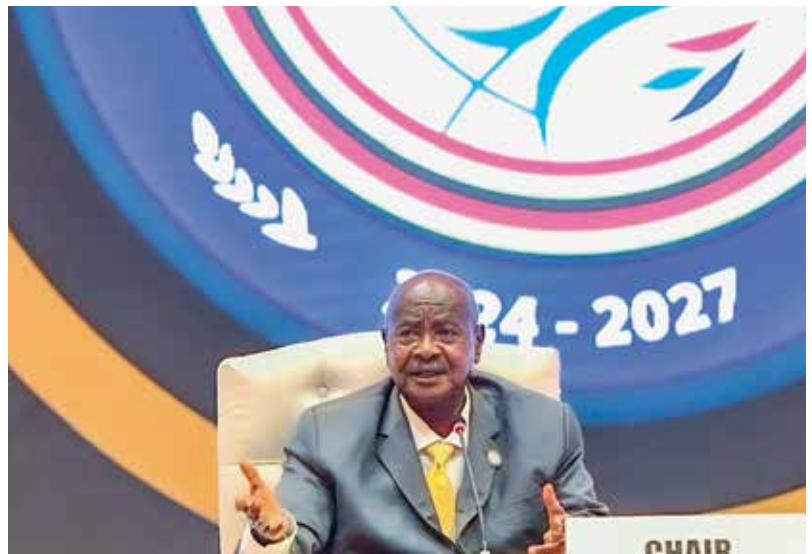
Two large meetings in Kampala, that of the Non-Aligned Movement and the G77, highlight the ending of almost 600 years of colonialism. Here, Yoweri Museveni, President of Uganda, who assumed the four-year NAM chairmanship Jan. 19, 2024.

This is a really big development: It means that the countries of the Global South that have long since become the Global Majority are intending to end a system of 600 years of colonialism. The Western oligarchy is sitting on an incredible bubble of unpayable derivatives. It's just a question of time—they always have a way of moving some tricks in the system—but there is an end to the road in sight, and the only question that should concern anybody who is in their right mind, is, can we convince enough sections of the so-