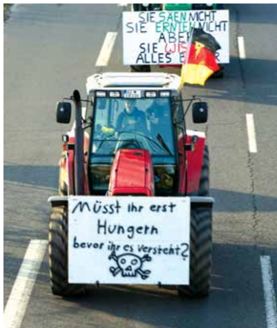
A German farmers' protest tractorcade against the government's anti-food policies, near Mainz, Jan. 8, 2024. The sign reads: "Do you have to starve before you get it?"

Now, I took the opportunity to compare what was reported by this CORRECTIV group, by looking at some of its press coverage, and all I could find is that some of these people apparently quoted from a book from some Austrian author [Martin Sellner] who is part of the Identitarian Movement Austria. His book is out in the fourth edition, in which he proposes the re-transport of a lot of foreigners back to their home countries. When I compared the text which was used, it's identical to what Chancellor Olaf Scholz said in a [Oct. 21, 2023] cover story in Der Spiegel , for a "Big offensive for re-transport of asylum seekers"—the same language!