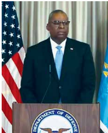
U.S. Secretary of Defense, Lloyd Austin, speaking before the Ukraine Defense Contact Group at Ramstein Air Base in Germany.

Germany right now is in a free fall—not least as a result of the sabotage of the Nord Stream gas pipelines, which triggered the high energy prices. Germans are fighting for their very existence, not only materially. People are really upset. I just find what happened incredible! On Monday, Jan. 8, when their demonstrations started, the farmers had an incredible demonstration with 100,000 tractors! The whole country was practically