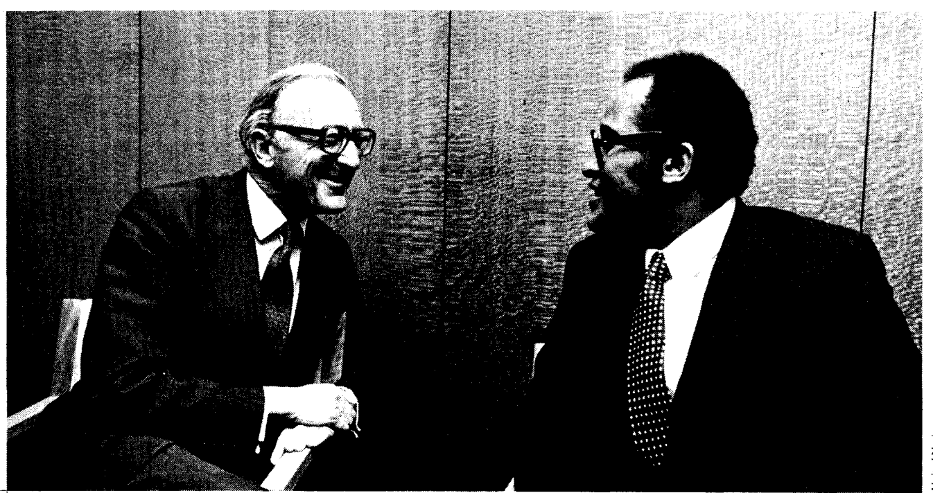
Lord Carrington, U.K. Minister for Foreign and Commonwealth Affairs (1), with Salim A. Salim of Tanzania, then president of the U.N. General Assembly.

In 1965, the Commonwealth formed an official secretariat to coordinate its policies. Chaired since 1975 by Guyanese parliamentarian Sir Shridath Ramphal, a turncoat oligarchist strongly favored by the Queen, the secretariat holds well over 100 meetings on topics ranging from regional agricultural problems to disarmament every year. It has acted through the period of the 1970s—wracked with repeated oil and financial crises that have ravaged Third World economies—as the only permanent and functional coordinating body on advanced sector/developing sector ("North-South") relations anywhere in the world.