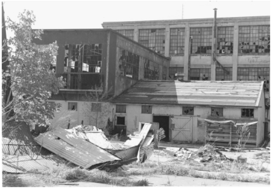
We are at that "future point" now, reaping the lawful consequences of "post-industrial" policy decisions from smalltime local decisions to larger decisions of government over the past three decades, LaRouche writes.