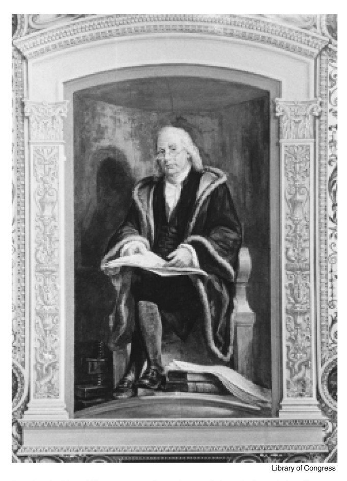
Benjamin Franklin, promoted a science-driven industrial policy and the use of a paper currrency for state credit, "which became the hallmark of the superiority of the constitutional American System of political-economy... over the usury-based systems prevalent in England and other parts of Europe." Here, Franklin's portrait in the U.S. Capitol.

So, from the beginning, the American System of political economy, as defined by Benjamin Franklin, among others, presumed continuing emphasis on the acquisition and use of newly discovered universal physical principles, and of improved technologies correlated with emphasis on fundamental scientific progress. Thus, today, there is no happy future for mankind anywhere on this planet, without an immediate emphasis on massive expansion of nuclear-fission as a source of power, and a massive commitment to the development of applicable technologies of thermonuclear fusion.