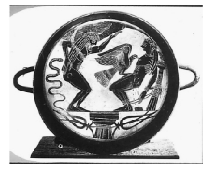
This Greek vase painting from around 500 B.C. depicts Prometheus (left) condemned by the Olympian Zeus to be bound on a desolate rock, where each day an eagle eats his liver. Prometheus' crime was to bring the gift of fire (and hence industry) to man, so that man would no longer be a slave. At right is Atlas, Prometheus' brother, who was also punished by Zeus, and condemned to hold up the sky.

Since the rise of what we recognize today as the ancient Greek civilization of about 700 B.C. and onward, European civilization, in particular, has been the victim of the vicious practices of what are known interchangeably as "imperial-