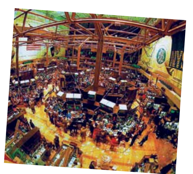
The application of the Glass-Steagall principle will separate the debt related to physical production, as in this school construction, and that related to speculation, the activity seen here at the New York Stock Exchange.