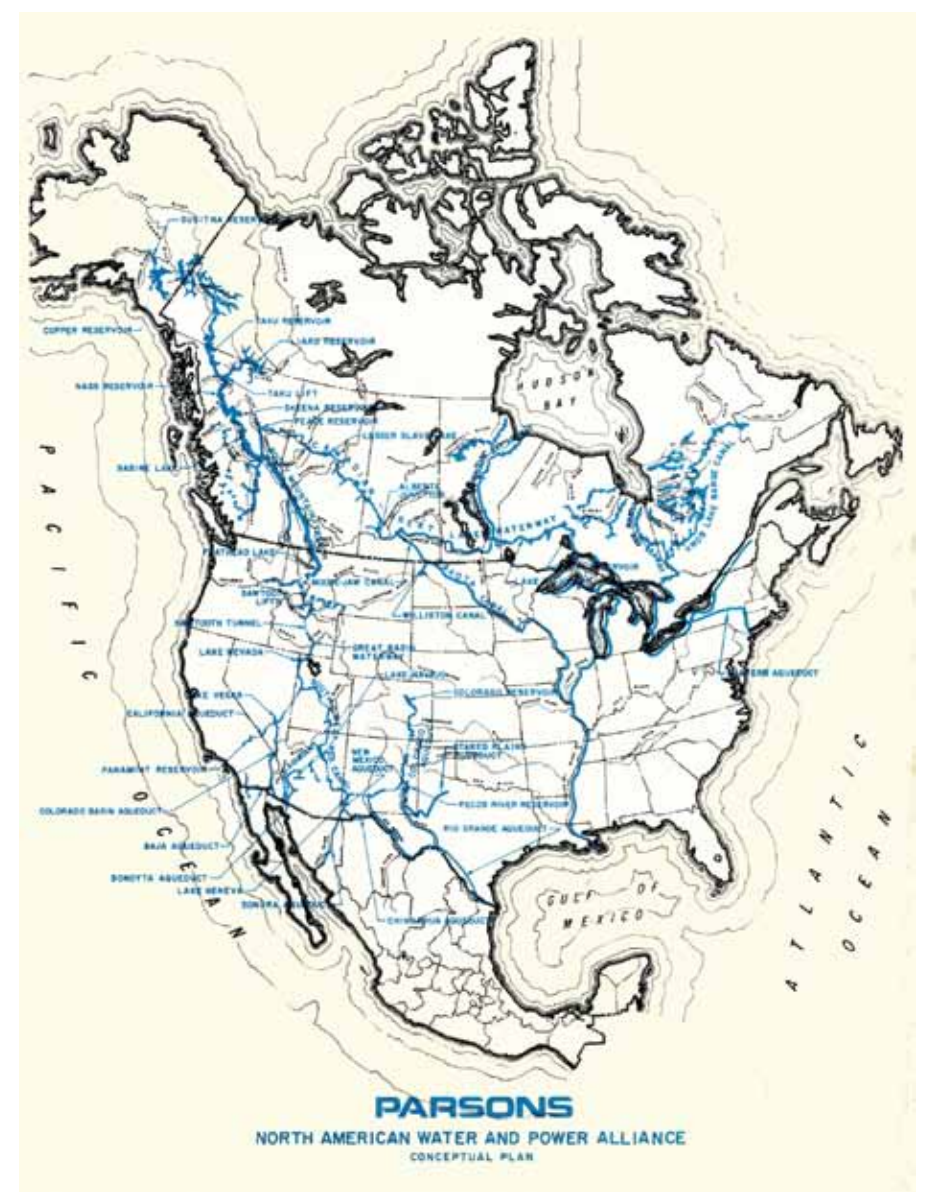
The concept for NAWAPA, laid out in the 1960s by the Parsons Company, has been updated by LPAC's Science Team, and provides the unique basis for reviving the U.S. economy, on a higher scientific and technological platform.

But you have to understand why it becomes a major driver: First of all, NAWAPA restores the water balance of the United States, so we don't have a food shortage. It also reverses the long depletion of water resources of the Western Plains, for example: We have been drawing down the water reserves of the Western Plains by pumping, without putting anything back in to restore those water supplies. The control of weather, through control