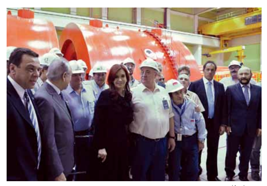
Argentine President Cristina Fernández de Kirchner, with workers and national and provincial officials at the launch of the Atucha II nuclear plant on Sept. 28, 2011.

bank, and accept 5% inflation, or be blamed for Götterdämmerung.