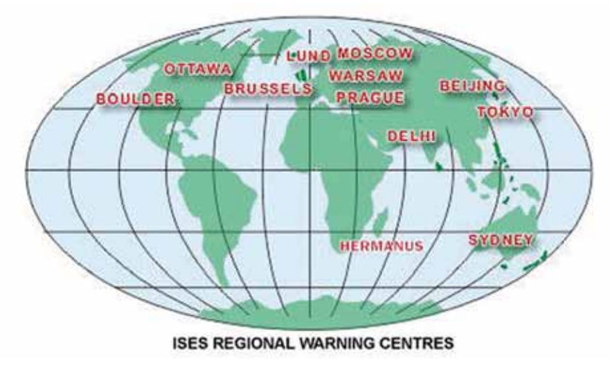
International Space Environment Service

Space weather has been around for a long time, of course, but we recently coined the term. It's become a hot topic, because of the effects it's having on technol-