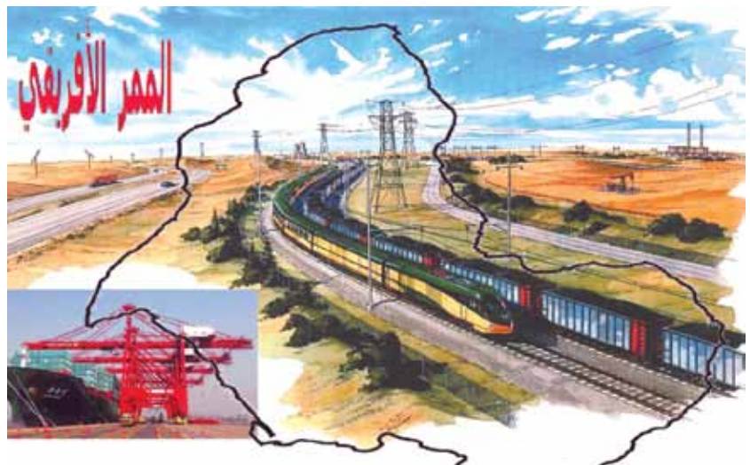
Artist's Depiction of the Africa Pass Project