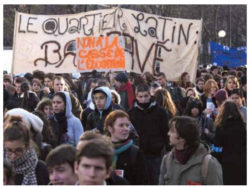
Youth, both to the north and the south of the Mediterranean, are fighting for a future, against the chaos we see today. Left: a demonstration during the Tunisian uprisings, Jan. 23, 2010. Right: Students in Paris demonstrate against the government's austerity, Jan. 15, 2009.

other hand (and this is part of the madness of the whole policy), the debtors, having no haircut, and no chance to repay their debts, are obliged to save money in macro-economic terms, namely, to increase taxes, to decrease incomes, and from a smaller GDP, to pay more for repayment of debt. This is an impossibility, and some of the speakers before have demonstrated this for Spain, and even for Greece. It is a humiliation of the people in those countries to urge them and to force them to pay more from a reduced income and reduced ability to survive. But this is the reality.