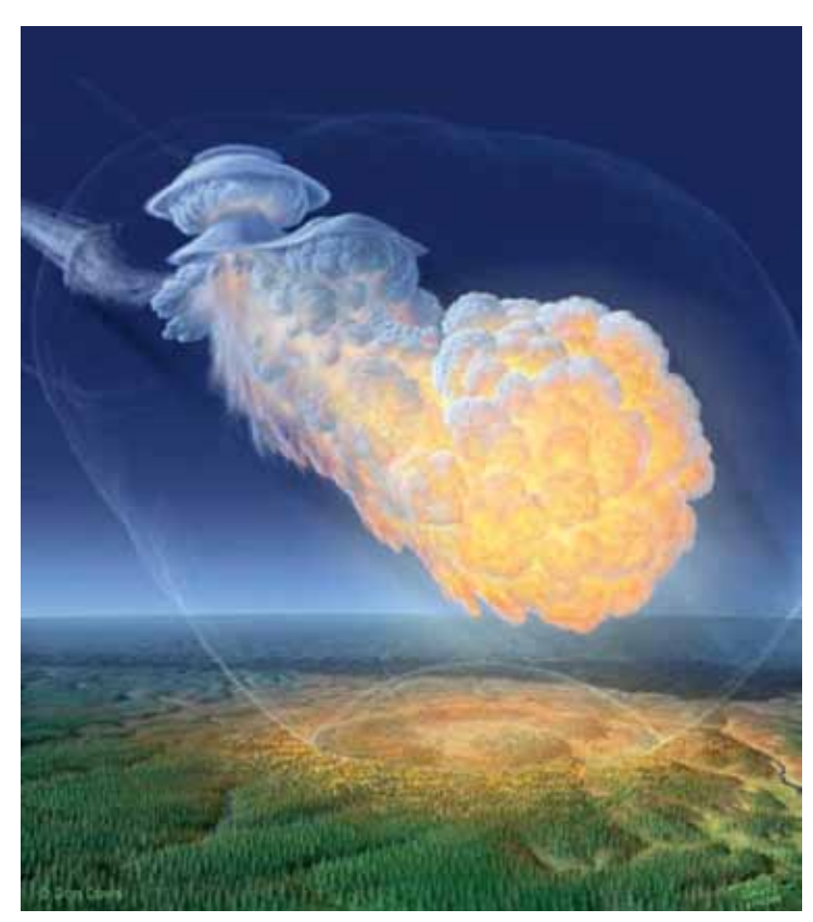
Artist Don Davis's rendition of the explosion of an asteroid or comet over the Tunguska region of Siberia in 1908.