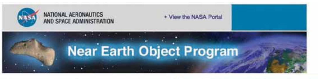
FIGURE 5 Forecast of Near-Earth Object Close Approaches

NEO Earth Close-Approaches Between 1900 A.D. and 2200 A.D. limited to encounters with reasonably low uncertainty