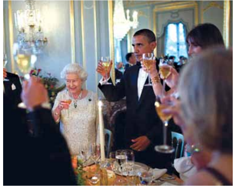
The British imperial policy—to reduce the human population by many billions—is now being implemented throughout Europe, and in the United States, as specified by the Queen of England and her puppet, President Obama (shown here in London May 2011), LaRouche declared.

much about it. Because they're all tied in, so heavily, to the so-called euro system. The euro system is a mass suicide system of the unwilling.