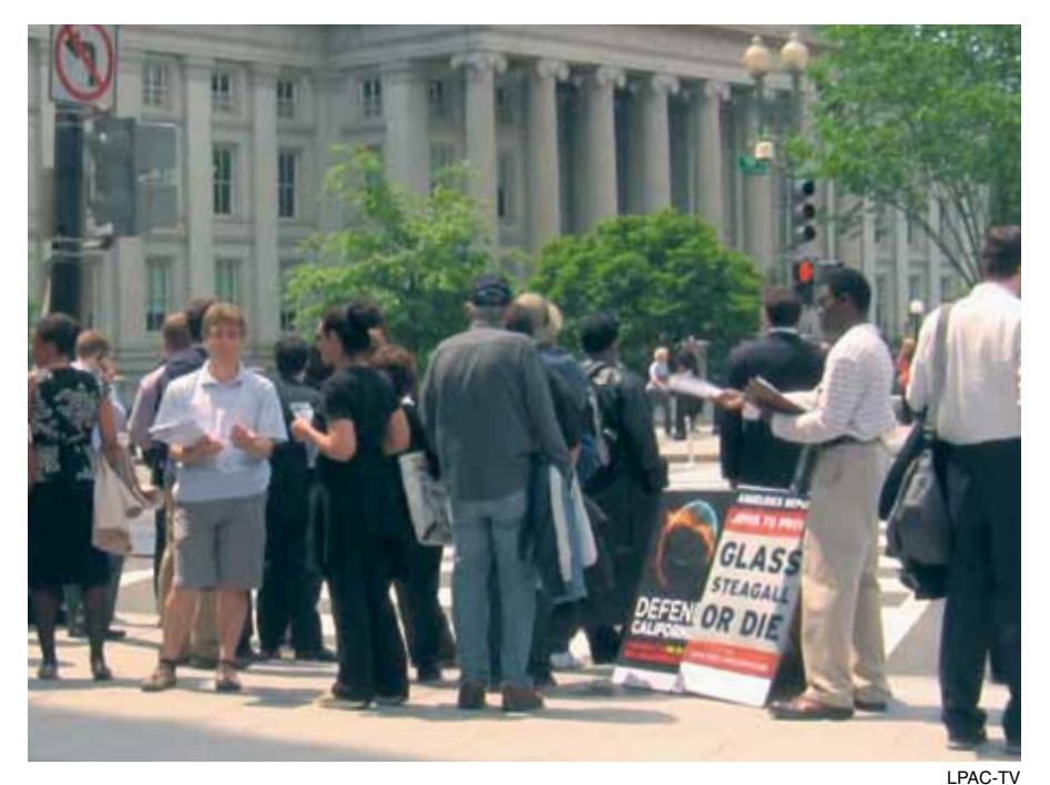
The Glass-Steagall policy, if applied, will save the United States, and Europe as well. Here, LaRouchePAC organizers in Washington, D.C., in front of the Treasury Building, May 2011.

And it's a natural thing for mankind to use nuclear power. It's an unnatural thing not to use nuclear power. It's an insane thing not to use nuclear power. Because the continued existence of man, in the face of the threat from inside the Solar System, from asteroids and other things in the system, which are now becoming an increasing threat, and source of threats—that will be reported elsewhere, later today. There was never a purpose for nuclear weapons. The Nazis had even thought about using nuclear weapons. Hitler had killed it, at that point.