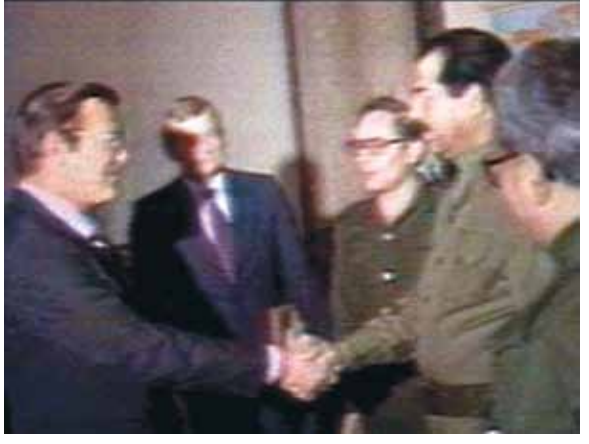
Saddam Hussein welcomes presidential envoy Donald Rumsfeld in Baghdad, Dec. 20, 1983. The U.S. knew Iraq was building stocks of chemical weapons.

Aug. 29—Declassified CIA documents published by Foreign Policy on Aug. showing that the 26, Reagan Administration knew about Iraqi chemical weapons in 1988, but didn't do anything about it, picks up the story many years too late. As EIR and others have reported, it was the policy of the Reagan and George H.W. Bush administrations, up until the eve of the first Gulf War, to supply Iraq