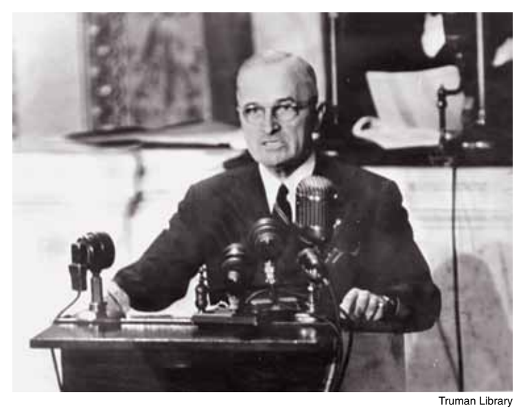
On March 12, 1947, Truman addressed a Joint Session of Congress (shown here), and announced the "Truman Doctrine," effectively ending the wartime alliance with Russia, and announcing the aid package for Greece and Turkey demanded by London. Thus was American foreign policy delivered to its historic enemy, the British Empire.

an issue of 'pulling British chestnuts out of the fire,' but of preserving the security of the United States, of Democracy itself.'"