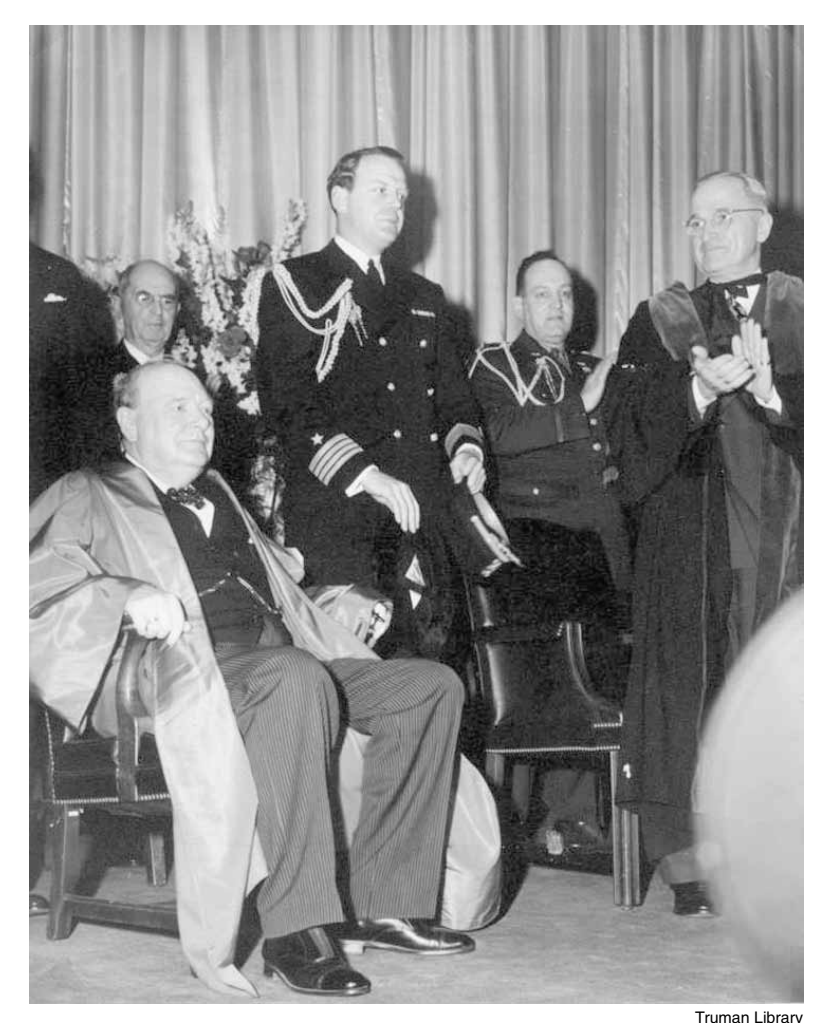
President Truman applauds British Prime Minister Churchill (seated), following Churchill's infamous "Iron Curtain" speech, officially launching the Cold War, March 5, 1946.

Churchill's speech with a Memorandum dated April 2, 1946, entitled "The Soviet Campaign Against This Country and Our Response To It." The Soviet government, it said, was pursuing three policies: "the return to pure doctrine of Marx-Lenin-Stalinism; the intense concentration upon building up the industrial and military strength of the Soviet Union, and the revival of the bogey of external danger to the Soviet Union.