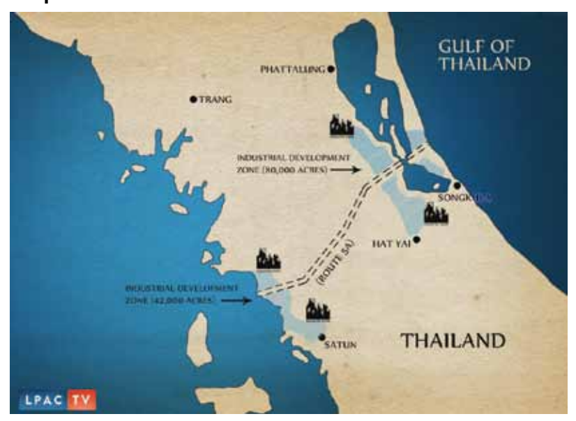
FIGURE 2 Proposed Route of the Kra Canal

cial economic zone has revealed that the 26-metre-deep and less-than-100-kilometre-long waterway would cost about US$20 billion to build, and reduce shipping times between the South China Sea and the Andaman Sea by at least 48 hours.