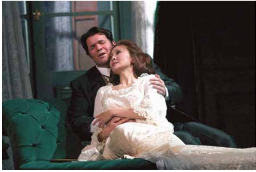
The concluding scene from Giuseppe Verdi's opera La Traviata.