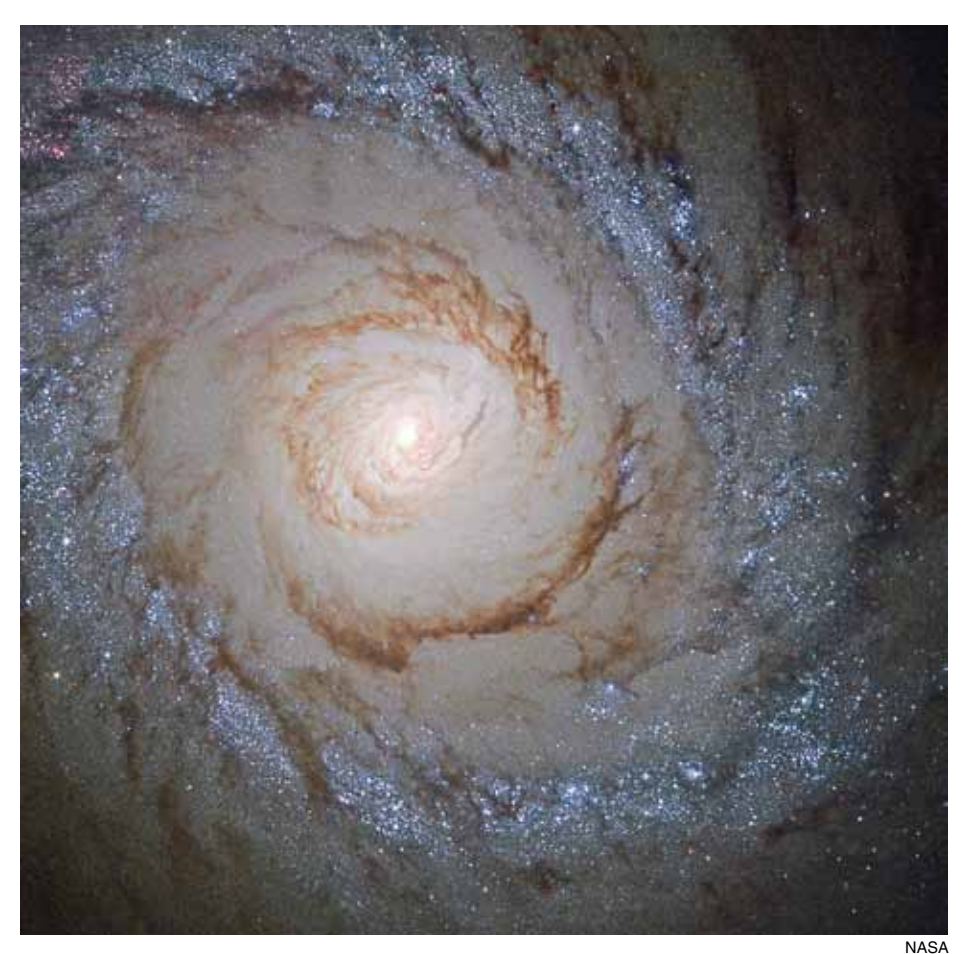
But you have to have, first The Hubble telescope shows a starburst ring around Galaxy Messier 94.

Only mankind has the ability to create a change in its own existence, by making what are tantamount to improvements in mankind's ability to deal with things. And this goes with the Galaxy; it goes with the Galactic System. It's not just what happens on Earth. Mankind has an impact beyond Earth! That's the essence. The development of mankind's skills, the development of all the things that mankind developed, the achievements are all of that nature.