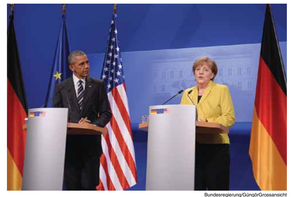
Obama and Merkel hold a press conference on April 26 at Obama's mini-summit in Hannover. She said "yes."

In the latest incident in the Baltic—when Russian fighter aircraft flew over U.S. warships operating about 75 miles off the coast of Kaliningrad, the Russian enclave between Poland and Lithuania—the U.S. side invoked what it calls "anti-access/area denial" (A2AD)