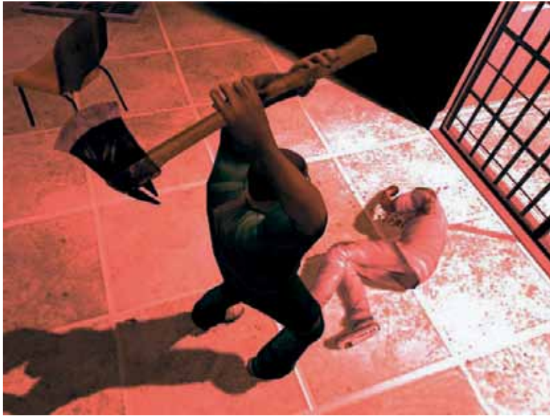
A snapshot from a killer video game.

case had chosen that day as the fifth anniversary of the Breivik horror show in Norway five years ago; the anniversary was on that day. German Interior Minister [Thomas] de Maiziere said afterwards that the harmful effects of killer video games on young people cannot be doubted.