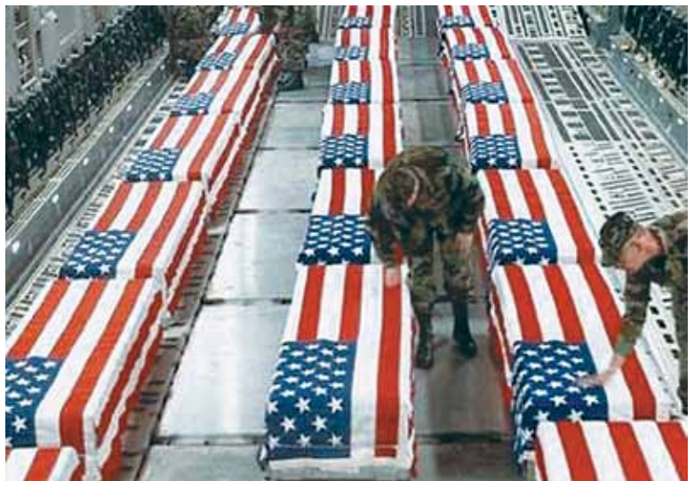
One plane of many that returned from Iraq, loaded with flag-draped coffins.

While President Obama, his CIA Director John Brennan, and the Saudi Royal Family attempted, in vain, once the pages were made public, to claim that the 28 pages “vindicated” the Saudis and showed no direct