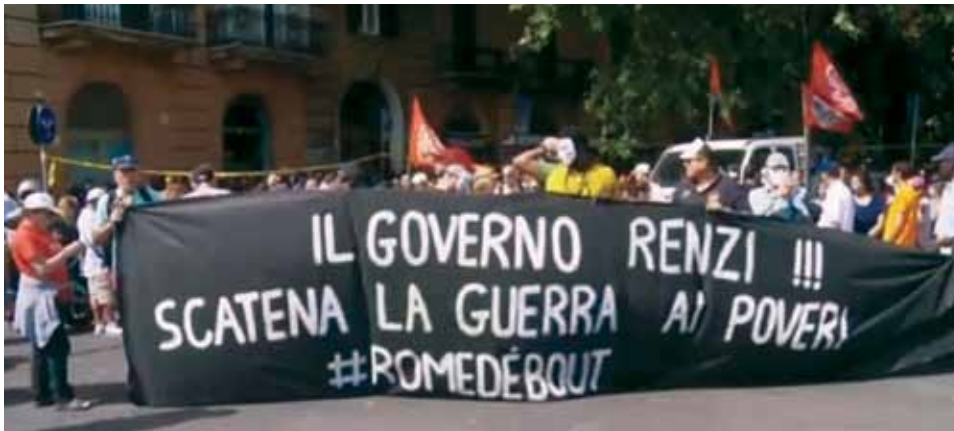
Press TV news video as seen on youtube

Anti-austerity protests in Italy send a message to Prime Minister Matteo Renzi.