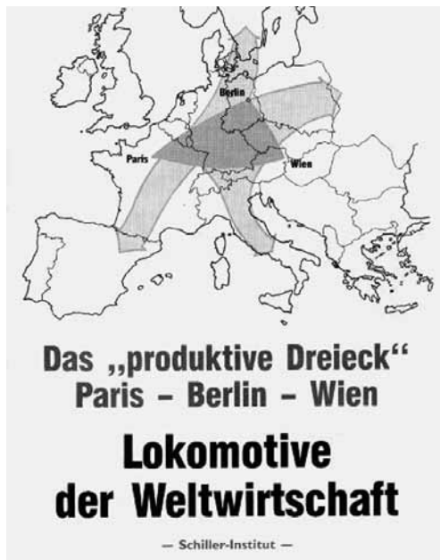
A map of the productive triangle, from Paris to Berlin to Vienna, the industrial area proposed by Lyndon LaRouche as a locomotive to the world economy.

In 1998 the trap was set when Citicorp and the Travelers Group announced to the world that they had merged, creating "Citigroup," becoming at that time the largest financial corporation in the world. Under the provisions of Glass-Steagall, this merger was illegal, since Glass-Steagall prohibited banks from merging with insurance underwriters. The Citicorp/Travelers announcement was