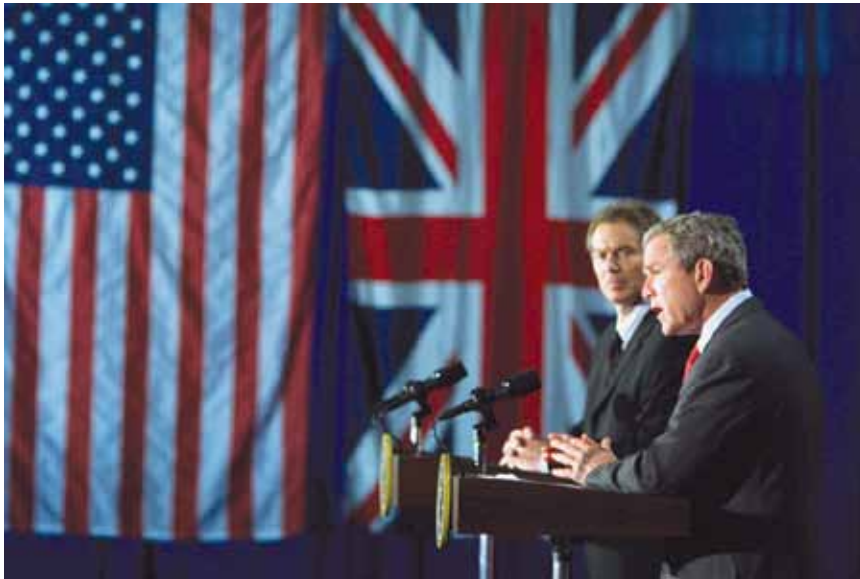
George W. Bush Presidential Library

President George W. Bush and British Prime Minister speaking at a joint press conference May 2, 2002, after meeting in Crawford, Texas. The meeting was referred to as the Crawford War Council.