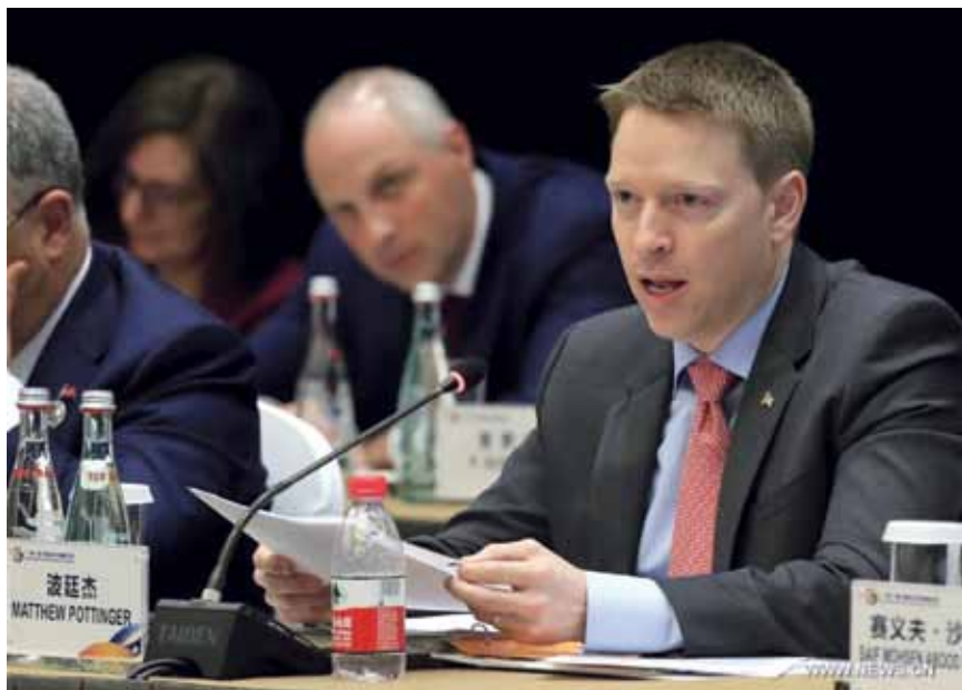
Matthew Pottinger, a member of the U.S. National Security Council of the administration of President Trump to oversee Asian affairs, represented Trump at the May 14-15 Belt and Road forum in Beijing.