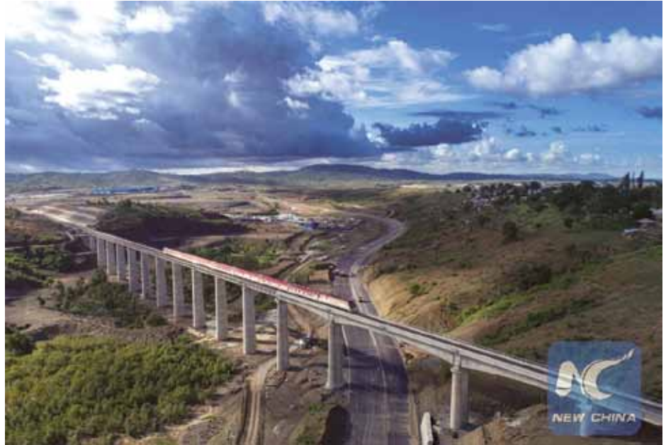
Chinese-built high speed rail in Kenya.

I'm saying this because I think the danger of a new financial crash is high, and the signs for that are mounting. The EU used to be really run by the Merkel/Schäuble combination, but Schäuble will no longer be finance minister, because one of the preconditions for