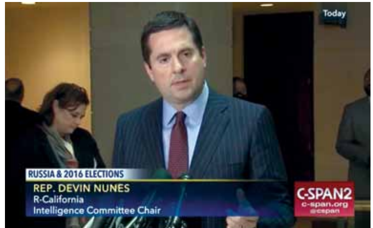
House Select Committee on Intelligence Chairman Devin Nunes.