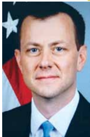
FBI official Peter Strzok.