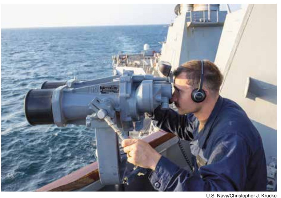
U.S. warships are now patrolling the Red Sea. Shown: On the bridge aboard the guided-missile destroyer USS Mason, Jan. 3, 2024.

dangerous situation. The situation in Southwest Asia is on the edge of getting into a larger conflict, a regional conflict. You had the hype around the attacks on ships in the Red Sea, by the Houthis [in Yemen]; the blame is that they were backed by Iran, meaning that eventually Iran could be involved. Now, there is no proof to my knowledge that the Houthis are backed by Iran—as a matter of fact, they have stated many