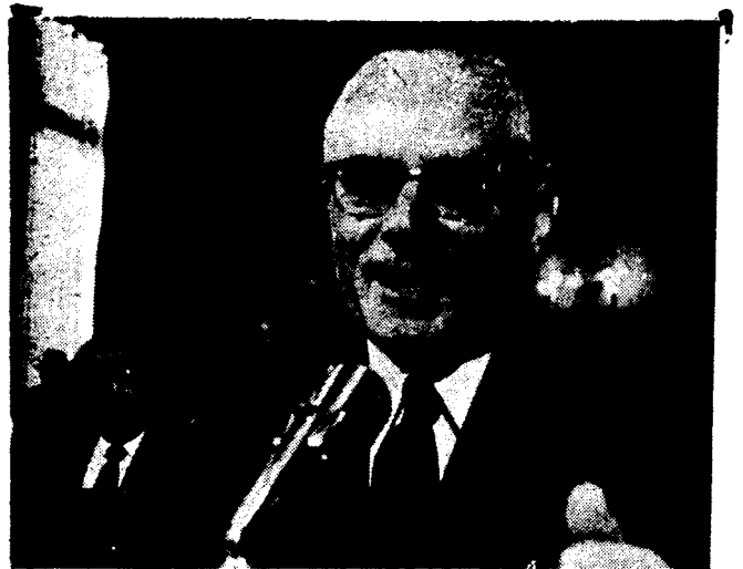
Butz conservatives who want to "keep the food at home" play right into Rockefeller's controlled environment.

The division between the Butz conservatives and the more sophisticated Rockefeller tendency has little practical significance. Butz' resistance to government-held reserves, like that of most farmers, plays into the Rockefeller gameplan by limiting debate to who should store the grain. Butz' opposition avoids the only real concern — a full exposure of how the Rockefeller cabal is