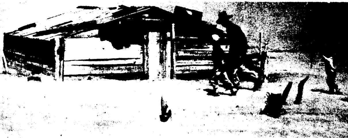
1931 all over again — only this time bankrupted farmers will be herded into slave labor "redevelopment" projects.

Sept. 19 (IPS) — President Ford's Sept. 18 speech to the United Nations General Assembly signaled the start of a new Rockefeller offensive leading into the Rome World Food Conference in November. With Rockefeller's oil sheikhs scheduled to begin the second Oil Hoax within weeks, a controlled environment will be produced in which the following "trade-offs" are planned: The Arabs will invest their surplus oil dollars in massive labor-intensive agricultural "development projects" in the underdeveloped countries, while the U.S. is drained of its grain production to maintain third world slave laborers on a 1,000 calories-a-day ration. A Rockefeller-dominated superagency known as the World Food Authority with a $5 billion-a-year capital will supervise this transfer of production to the Southern Hemisphere,