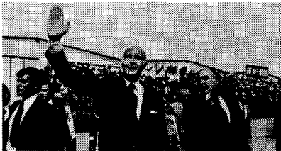
On the cover: French President Giscard d'Estaing with Mexican President Jose Lopez Portillo.