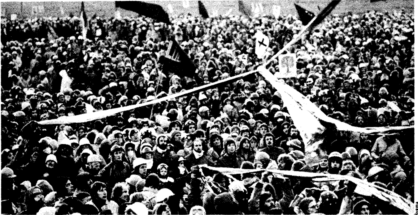
Antinuclear upsurge in West Germany.

This, in bare outline, is the policy background of the escalation against the most pivotal world leaders.