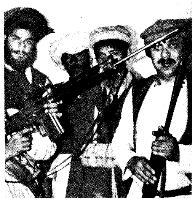
Drug-running Afghan rebels: part of the Crescent.

stan has sharply declined. The DEA estimated that Pakistan's illicit opium harvest from 1980 yielded 125 metric tons, and 126 metric tons was expected from the 1981 harvest. State Department officials and intelligence sources have cited the political instabilities of the region as the primary factor in bringing down production, specifically the fall of the Shah in Iran, the Soviet invasion of Afghanistan, and the massive influx of Afghan refugees and rebels to Pakistan's Northwest Frontier Province. Reportedly the drop in the price of raw opium also was a contributing factor in the cutbacks.