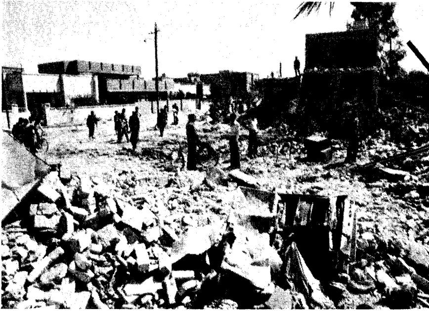
After an Iranian bombing attack on Baghdad.

NATO-created Club of Rome, which has been active through European-Islamic front groups like Islam and the West in promoting an Islamic fundamentalist bloc to replace the national sovereignty of the states of the Muslim world.