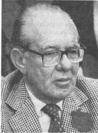
Alfonso López Michelsen