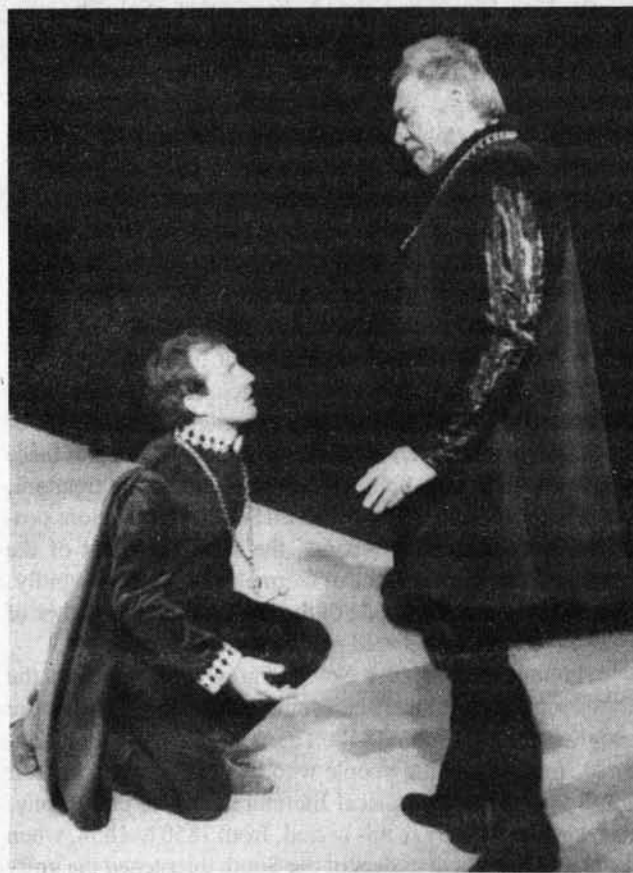
In Schiller's Don Carlos , the Marquis of Posa pleads with King Philip II to restore "the lost nobility of man." Here Philip (right) is portrayed with his son, Don Carlos.

Against this explosion of longing for freedom in Germany, which brought us quite close to the goal of a republican revolution and attained a level of culture that was probably higher than any other nation had ever achieved, the entire European oligarchy conspired—the evil Castlereigh and despicable Metternich (who not for nothing are both heroes of Henry Kissinger), Talleyrand in his silk stockings, the oli-