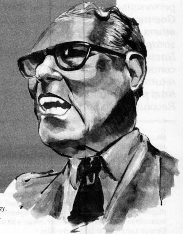
In 1941, the State Department branded Arnulfo Arias (right) a Nazi; but today, they have made him their candidate to overthrow the government of Panama.

In a confidential assessment of the Arias government by the military intelligence division of the War Department General Staff, his "pro-Axis" and "anti-American" sympathies are noted repeatedly: