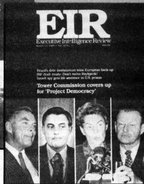
When LaRouche and EIR went after the drug traffickers and the Soviet connection to Project Democracy, the attacks against us escalated—from Moscow directly, and from the U.S. Justice Department.