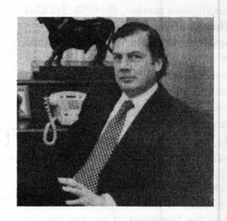
Edgar Bronfman, liquor magnate and Soviet agent of influence

It is well known that sections of the mafia were used by the U.S. intelligence services during World War II. The links between organized crime, misadventures in Cuba in the Kennedy era, and the plot to assassinate the President are too well-worked over to bear repeating here. They should be borne in mind in connection with the more recent Iran-Contra scandal, which has revealed that U.S. intelligence services