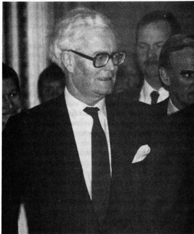
Foreign Secretary Douglas Hurd during a Jan. 31 visit to Washington: a pivotal British "mandarin" in the propitiation of the butchers of Beijing.