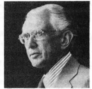
Sen. Howard Metzenbaum