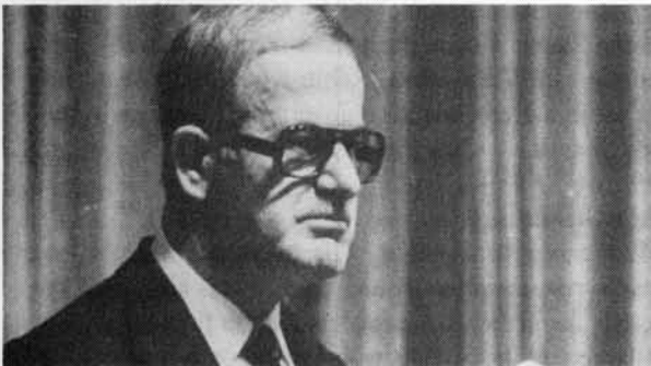
Some elements of the threat are: 1) the combination of Shamir, Arens, and Sharon (above) in power in Israel; 2) Yitzhak Rabin's (right) effort to take over the Labour Party; 3) U.S. appeasement of Syrian President Hafez al-Assad (left), which has left Lebanon as a sitting duck for further destruction.

so-called Polish provocation which officially launched World War II.