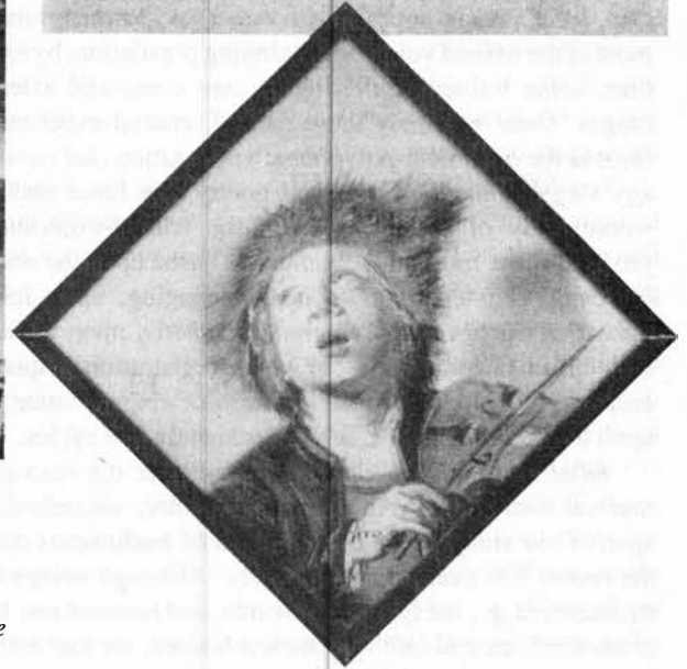
The orchestral and keyboard instruments, designed for a well-tempered scale pivoted upon C=256 , were developed in imitation of the characteristics of the bel canto voice-species. Pictured counterclockwise from above are moments in this history: angels singing polyphonic music (detail from a 15th-century Flemish painting); boy violinist (by the Dutch artist Frans Hals, early 17th century); man playing the newly invented type of flute (by Antoine Watteau, French, 18th century).