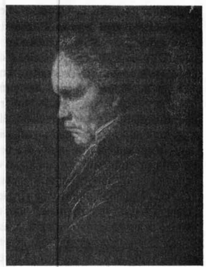
Left to right: Franz Schubert (1797-1828), Wolfgang Mozart (1756-1791), and Ludwig van Beethoven (1770-1827) each developed the proposition in Bach's Musical Offering , showing "the seamless union of scientific methods of musical composition and beauty."