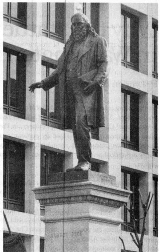
Gen. Albert Pike, supreme commander of the Scottish Rite of Freemasonry in the southern states, was the founder of the Ku Klux Klan in Tennessee in 1867. One of the most evil men in American history, his statue (right) gazes upon the predominantly black population of Washington, D.C. Who will bring it down?