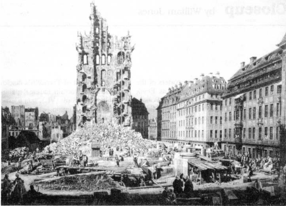
"Ruins of the Kreuzkirche," 1765, by Bernardo Bellotto. (Dresden, Staatliche Kunstsammlungen)