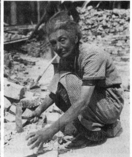
Women work to rebuild the war-ravaged city of Berlin, 1946. "People will sacrifice and do hard work, if there is a future in it. The idea of the future must always control the present. Not the past."