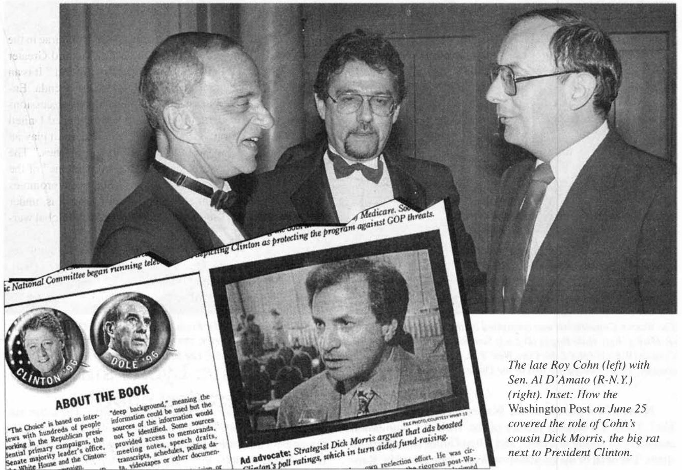
The late Roy Cohn (left) with Sen. Al D'Amato (R-N.Y.) (right). Inset: How the Washington Post on June 25 covered the role of Cohn's cousin Dick Morris, the big rat next to President Clinton.

all. There are ways they do that; I can tell you about that if you want to know, but that's how it's done.