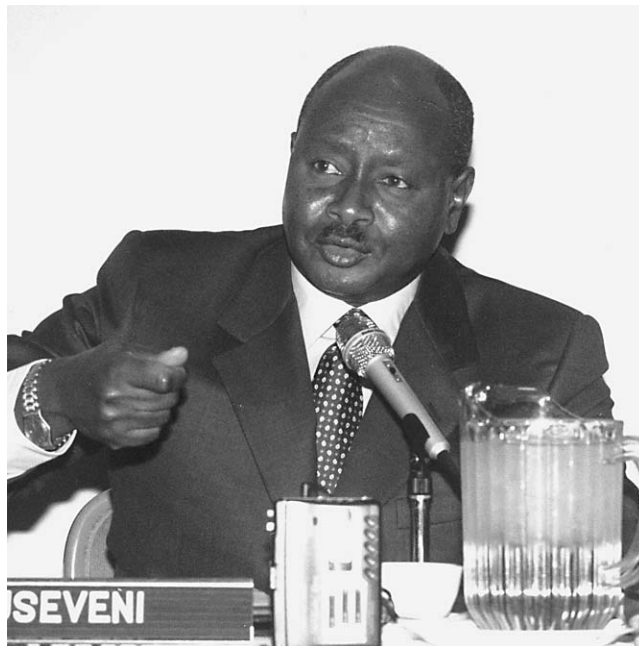
Uganda’s Yoweri Museveni: Life-expectancy in his nation is 40 years, yet he is leading a crusade for population control, and is being promoted by the global Malthusians.

Museveni also said that any improvements in Ugandan agriculture must be “appropriate,” with special sensitivity to the environment: “Simple technologies to alleviate the problem of ‘pseudo drought’ should be put in place to forestall erratic harvests, for example micro-dams from trapped rain-water with wind power to pump water into the fields. . . . I wish to assure you that we shall not allow the 2020 Vision to mature at the cost of degrading the environment. We shall not, if this happens, be able to sustain the Vision.”