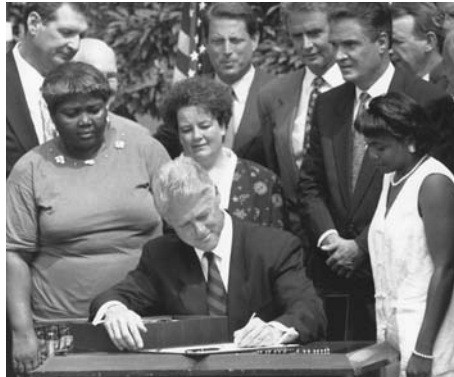
Clockwise, from top left: President Clinton with Chinese President Jiang Zemin in Manila; a White House event to promote NAFTA, November 1993 (left to right: Henry Kissinger, James Baker III, Clinton, Jimmy Carter); Clinton signs the welfare reform bill, August 1996; Clinton and Mexican President Ernesto Zedillo, May 1997.

acteristic of current trends in the Clinton Administration's formulation of foreign policy. For this purpose, we note certain similarities in these kinds of contradictory thrusts as they appear in the urgent matters of U.S. China policy, on the eve of the China-U.S.A. summit, with a similar pattern of contradictoriness in policy toward Central and South America.