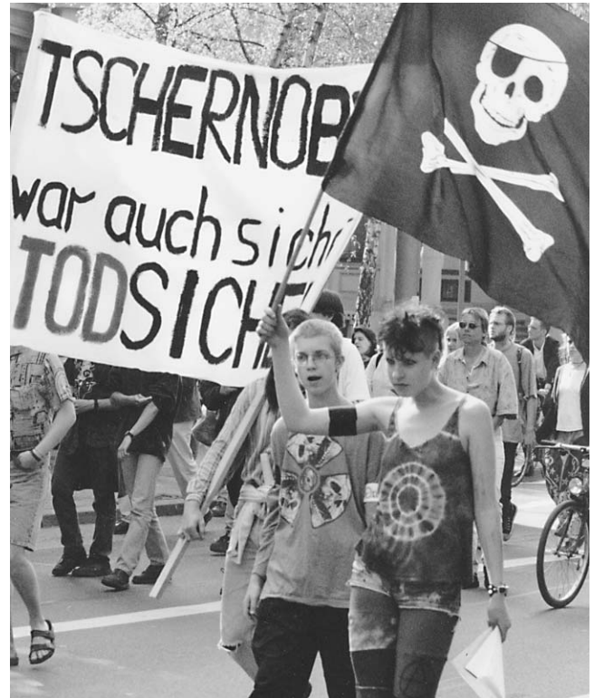
The counterculture turns out for an anti-nuclear demonstration in Wiesbaden, Germany, in April 1996, on the the 10th anniversary of the accident at Chernobyl. Slogans read “Nuclear Power? No Thanks” (left) and “Chernobyl was also a sure thing—sure as death” (right).

One: You had what Friedrich List referred to as “national economy,” the real economy: infrastructure; the nation-state as protector of national development; investment in scientific and technological progress; development of basic economic infrastructure; improvement of education; improvement of health care; improvement and fostering of scientific services. That was the national economy.