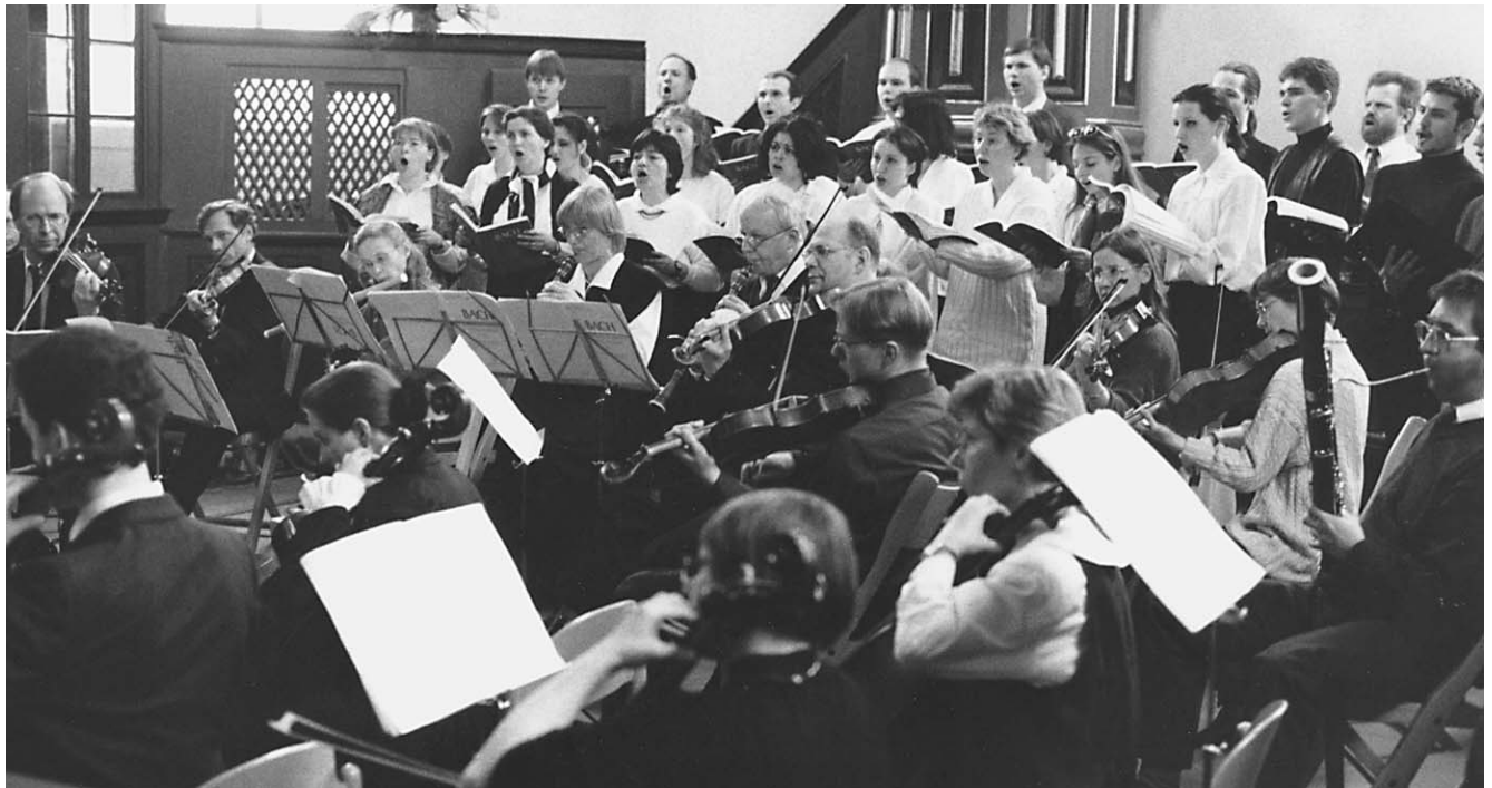
The Schiller Institute performs Bach at the St. Johannes Kirche in Dalsheim, Germany, March 1997. "Classical art is based on the same principles as scientific discovery; but Classical art studies the human mind as such, the individual mind, the relations among minds, in society. Classical art is the basis for statecraft: to study the mind of people."

The curvature of action in the very small, in the almost dimensionless magnitude of the cognitive powers of the mind, shapes the entirety of the trajectory of society as a whole. There it is: this not-entropic characteristic of this quality of creative potential in the mind, which generates macroeconomic profit; in the real sense, the physical profit.