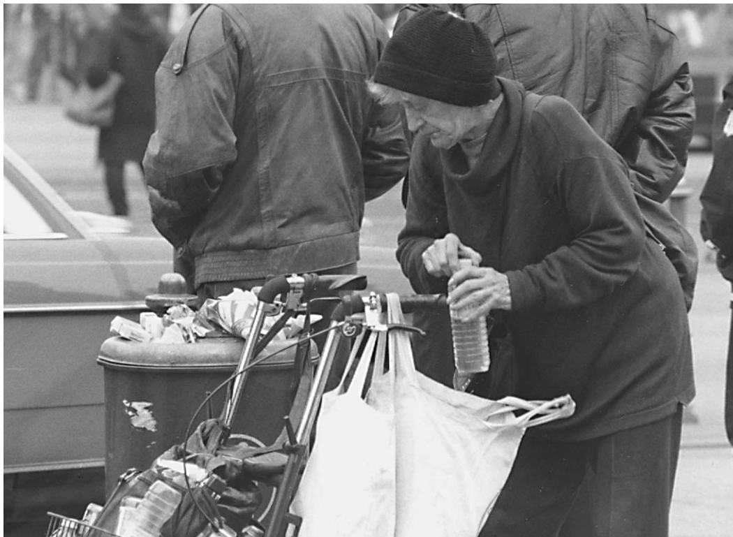
A homeless woman in Frankfurt, Germany. The self-destruction of the European economies since 1989, means that "the economic center of gravity on the planet is no longer Atlantic, but it is presently Pacific."

methods superior, then, to most of statistical methods used today in economic studies. They were wrong. Gauss selected, out of all the studies, three intervals, orbital intervals, which he used to determine the orbit of this, or the trajectory of the particular heavenly body. And, he was right.