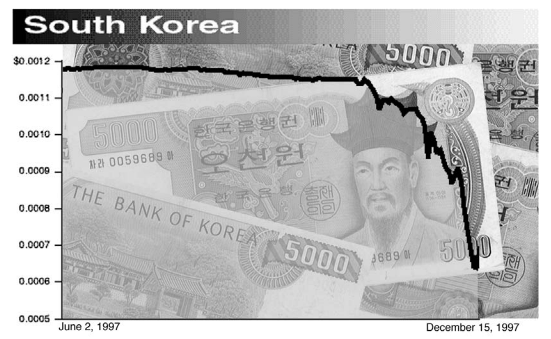
The precipitous collapse of the Korean currency, the won. "What would an astrophysicist say to you, if you reported such behavior by a star?"

In other words, within the global financial and monetary order, as it has developed since the British sterling crisis of 1967, there is no possibility anymore, for even a short-term survival of the existing international global financial and monetary system. Nothing can be done, even in the short term, to keep this system alive. There are no solutions within the terms of the system. There are no solutions within the terms of any IMF conditionalities. IMF conditionalities are simply a method of mass suicide of entire nations, or if not, murder.