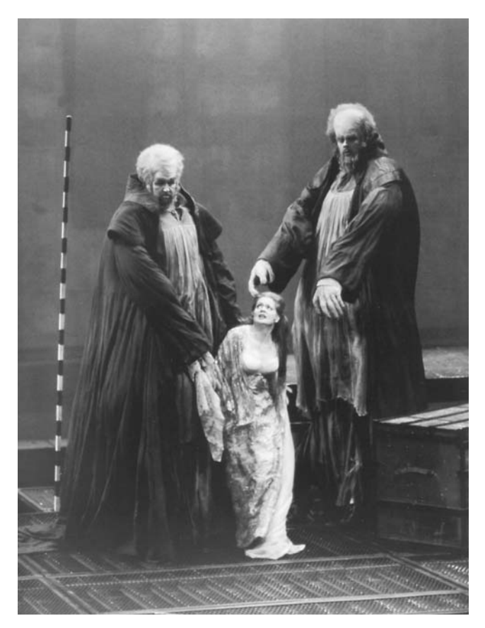
Romanticism is the creation of sensual, erotic effects—unlike Classical composition, which expresses ideas. Shown here: a scene from Wagner's "Das Rheingold," on PBS television, 1983. Wagner "gave up music in order to make bombs on stage," says LaRouche.

But Classical composition is important to us, whereas Romantic is not. Modern music is not necessary; put it out in the trash, where it would be happy, by itself. Popular music, as it has developed recently: Put it in the trash, it doesn't belong, it doesn't do anybody any good.