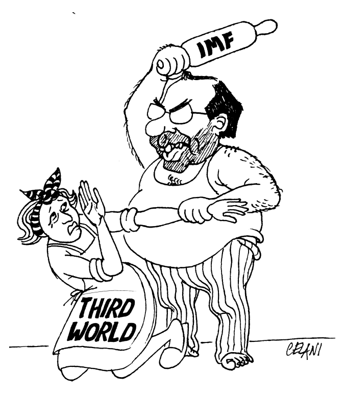
"Nothing personal! He does it only for pleasure."