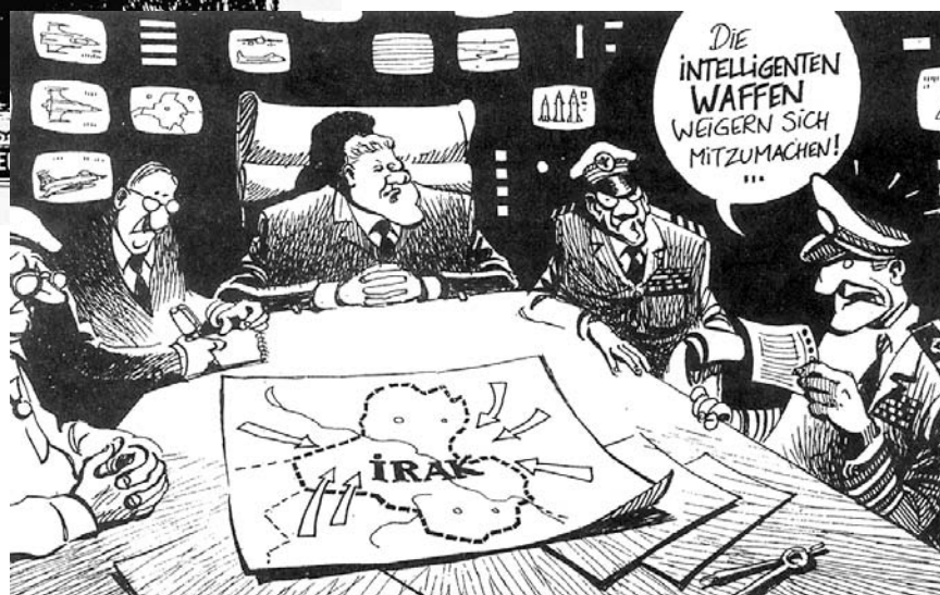
The international press comments on the two-pronged British operation against President Clinton. On the right, in a cartoon which appeared in the German weekly Weltwoche and the Austrian daily Die Presse , a general briefs President Clinton on Iraq: "The smart weapons refuse to go in." The spoof on Independent Counsel Kenneth Starr is from the Palm Beach Post .

"diplomatic" intervention against President Clinton. Falwell and Robertson also issued a mass call-up to evangelical ministers all across America, urging them to deliver simultaneous attacks against the President. Falwell told the New York Times , on Jan. 21, 1998, "There are about 200,000 evangelical pastors in America, and we're asking them all through e-mail, faxes, letters, telephone, to go into their pulpits and use their influence in support of the state of Israel and the prime minister." According to the Times , the Mayflower Hotel rally was convened by a group called Voices United for Israel , which has been denounced by several prominent Jewish American leaders as a U.S. front group for the Israeli Likud.